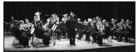
The Remiremont Brass Band from France, who will be visiting the area in August and playing concerts with the Enderby Youth Band